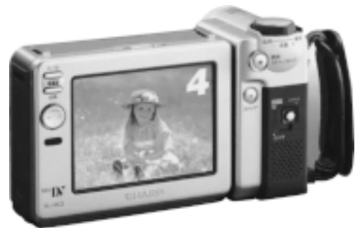
Photo 2 Digital View Cam VL-DC3.