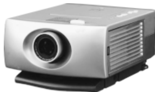
Photo 6 LCD-Projector XV-C1.

The starting point in developing the LCD-projector was to make possible the display of large images by means of projecting them from a small LCD. The design development was carried out, based on the concept, "Near-at-Hand Home Theater". The existing three-tube projector using CRT (Cathode Ray Tube) could offer one possible Home Theater System, but it failed to sell in large volume because it was too bulky, heavy and expensive. Additionally picture adjustment was very complicated. The main point of the new designs was compactness, mobility and