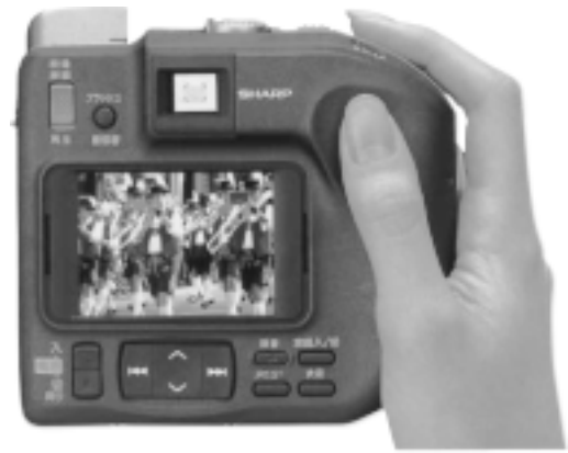
Photo 3 MD Data Camera MD-PS1.

SHARP MD Data Camera is the first digital camera in which an MD was employed as a recording media. The users can take full advantage of its high performance and functions to customize it. Recording capacity is up to 2,000 images, and the MD Data Camera not only records still images but also audio sound. The recorded images can be edited on the LCD screen. It may be connected to a personal computer and also perform as an audio MD, providing record/play functions.