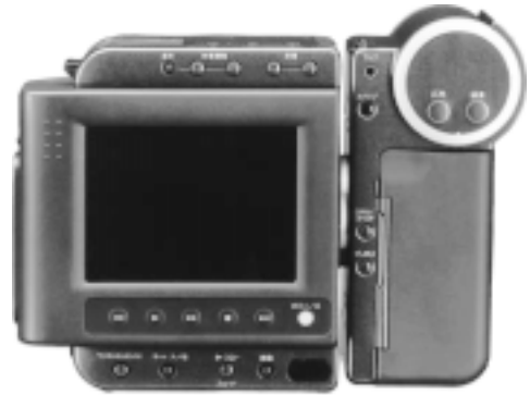
Photo 1 The first generation View Cam VL-HL1.

The basic concept remains even after new versions that offer digital performance and further compactness have been developed. The latest version, the Digital ViewCam VL-DC3 comes with digitized functions and compact size, and the operation has been made easier with employment of the GUI and cursor button, resulting in a simple design with less operational buttons on the product ( Photo 2 ). The ViewCam has brought a new field of "Movie camera with LCD" to the market that dominates 90% of the movie camera share (as of September, 1997).