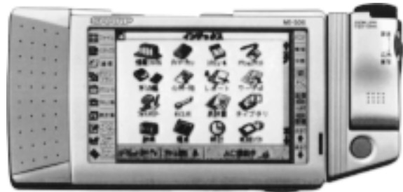
Photo 4 Power Zaurus MI-506DC.

The above mentioned functions were taken into consideration in early development stage of Power Zaurus. A series of portable size products simulations were created to come up with today's Power Zaurus design. Usability testing simulations were done to measure the design performance of the product in different scenarios (for example; while walking, traveling on a train, etc.). Other simulations included measuring the user's perception regarding the products use in many different given situations (for example; removes the cover, takes out the pen tool, and data input onto the screen, etc.). These usability tests helped to create this basic design: oblong shape, the holding part on the left side of the main body, a cover that can open wide to its back, and a pen-tool storage that is allocated in front to take out a pen-tool with ease. These details are now incorporated into a typical design for a pen-input base PDA ( Photo 4 ).