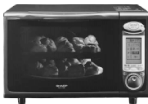
Photo 7 Microwave oven with LCD cooking guide.