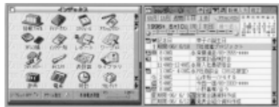
Photo 5 GUI design on screen of Power Zaurus.

With regard to the GUI, the interface design was made optimal for pen-input. ( Photo 5 ).